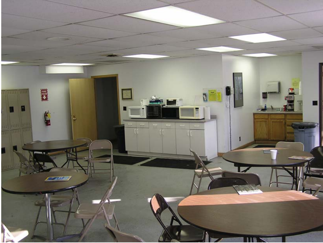
Typical Lunch Room