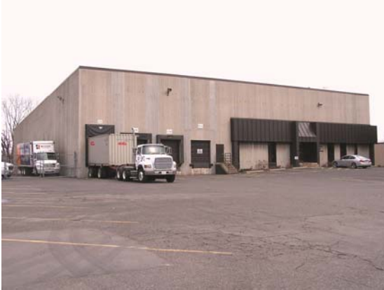
West Elevation Docks