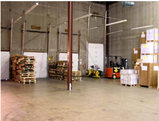
Loading Area - Inside