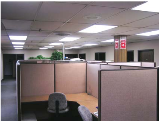
Main Floor Cubicles