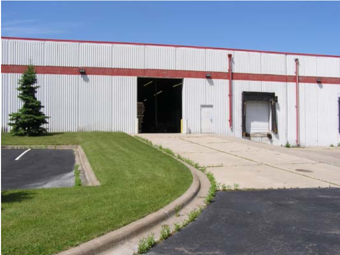
Dock Door & Drive In