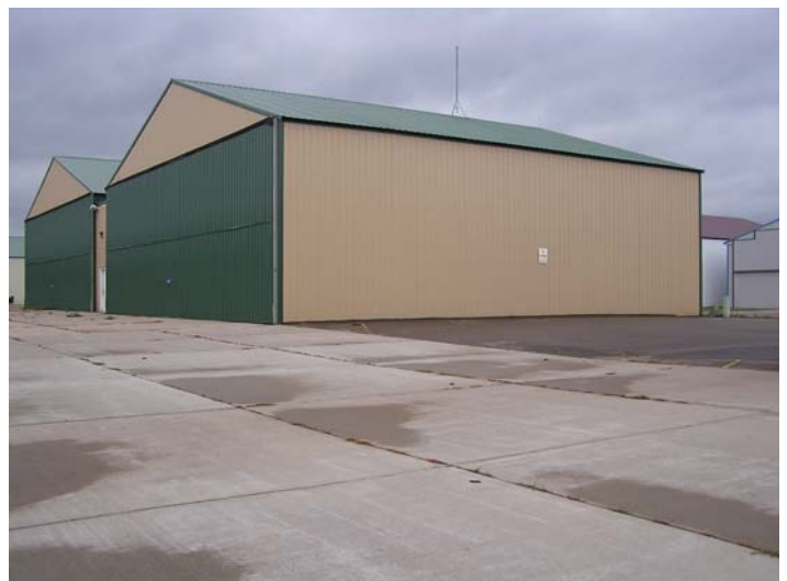
Hangar Plus Vehicle Parking

Information contained herein has been obtained from the owner of the property or from other sources that we deem reliable. We have no reason to doubt its accuracy, but we do not guarantee it.